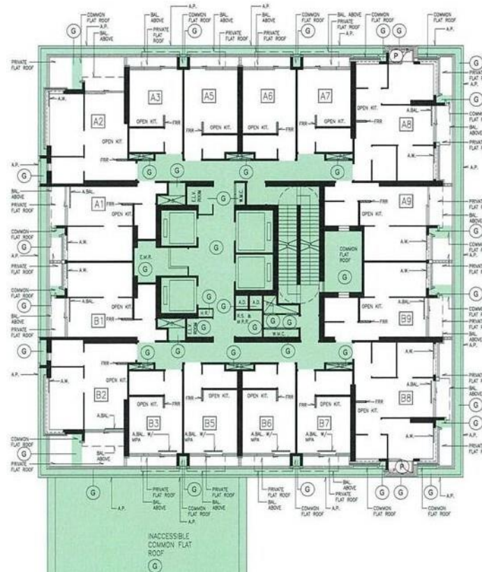
TOWER 1, 2ND FLOOR PLAN

RESIDENTIAL DEVELOPMENT AT 1-3 SHEK KOK ROAD, AREA 85, TSEUNG KWAN O, N.T. TSEUNG KWAN O TOWN LOT NO. 121 TOWER 1, FLOOR PLANS (1/4) DWG NO.: DMC -LP-05